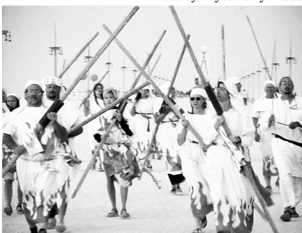
All Hail! the lamplighters that light your way home.