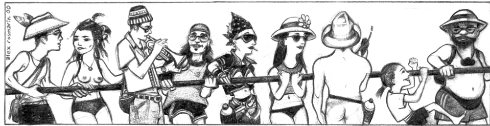
"Isn't this a lot of work for just one erection?"