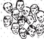
Where Good friends meet!

Please note the location of the nearest outpost or plaza if you're not living near Center Camp. This year, in addition to existing medical and Ranger outposts, the plazas will also contain Bulletin Boards for participants to share information. Nearby, there will also be CIVIKs, which stands for Civic Information Kiosks containing valuable information from the Burning Man Organization that you should be aware of.